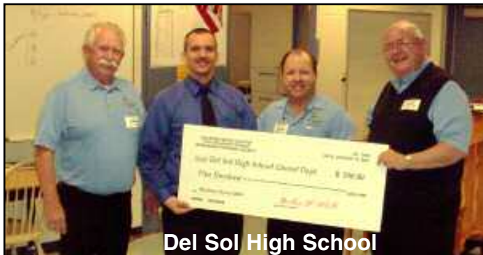
Del Sol High School