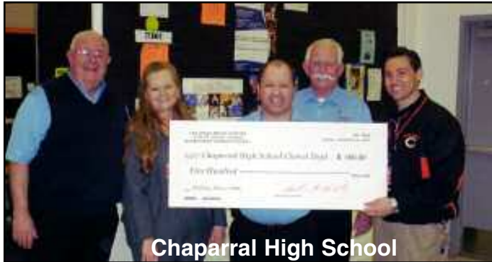
Chaparral High School

The "City Of Lights" Chorus developed a Youth Outreach Program and made donations to the vocal music departments of two local high schools totaling $1000.00. The presentations took place January 26th at Chaparral High School and Del Sol High School, to the Directors of Vocal Music of each respective school, during the choral groups' class. The school's Principals and the Superintendent of the School District were in attendance.