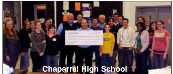
Chaparral High School