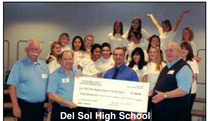
Del Sol High School

The chapter intends to continue using HS choral groups in their future shows, to spread increased interest in barbershop harmony to our youth, and help preserve barbershop harmony through the increased younger people in our chorus as a result.