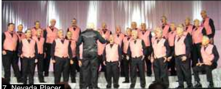
7 Nevada Placer