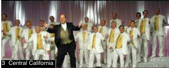
3 Central California