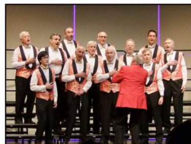
8 San Francisco, CA 52.8