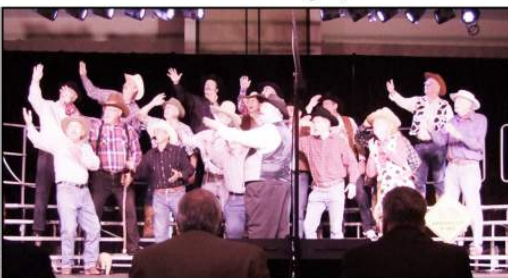
6 Fullerton, CA 61.3