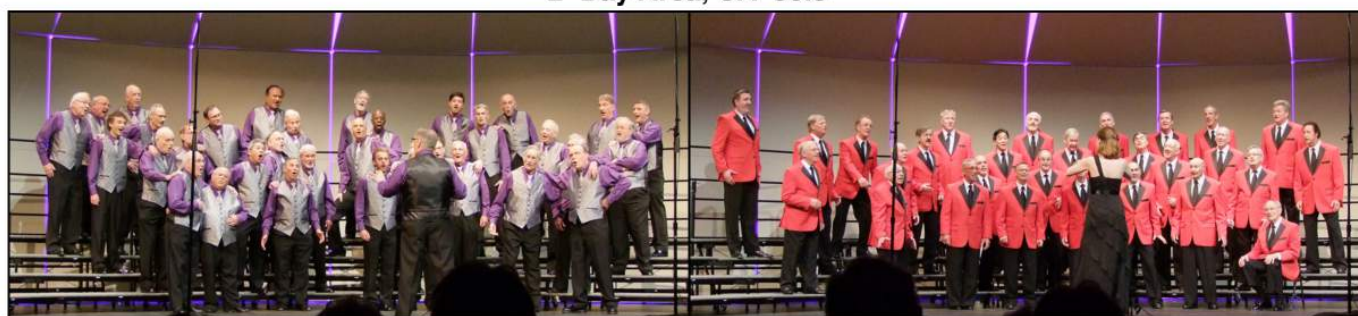
3 Palo Alto - Mountain View, CA 66.6