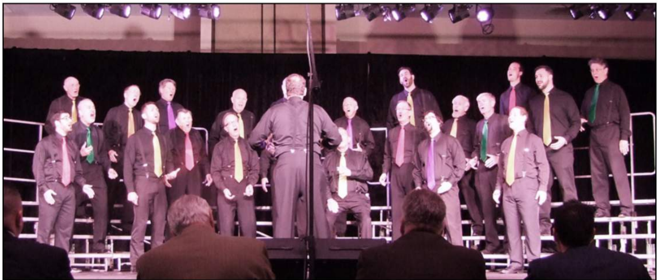
1 Rincon Beach, CA 71.8