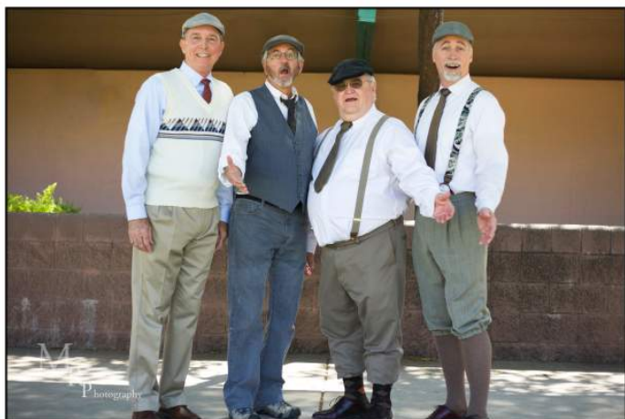
7 Quadratic Audio 64.8