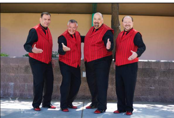
6 Heatwave 67.5

Photos from the Arizona Division Convention were taken by MirandaRicoPhotography. Copies can be purchased at tucsonbarbershopharmony.org