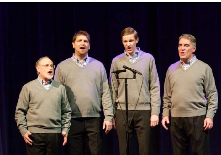
4 Miles Ahead 67.8