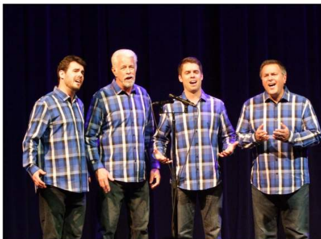
1 Don't Tell Mom 79.8