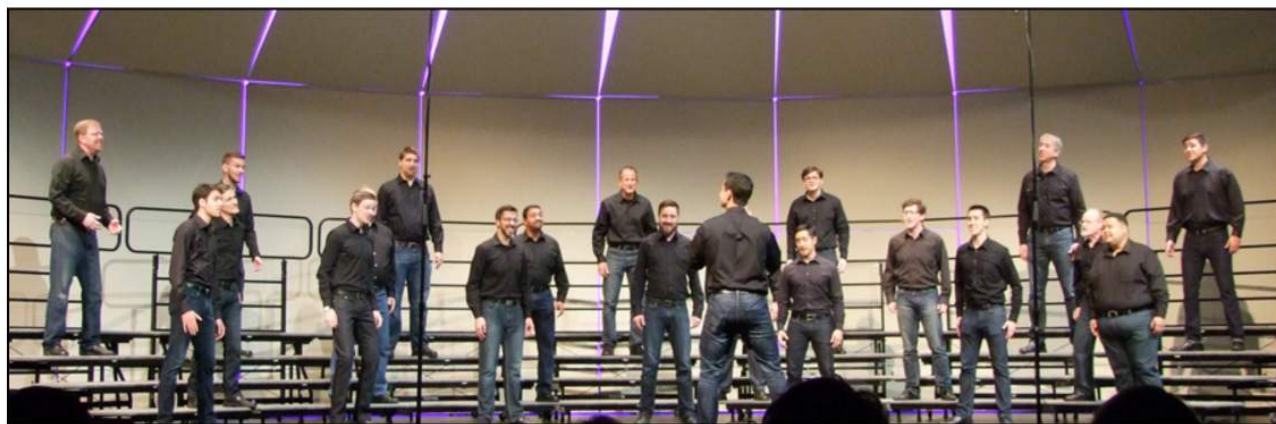
1 Whittier/San Francisco, CA 81.9