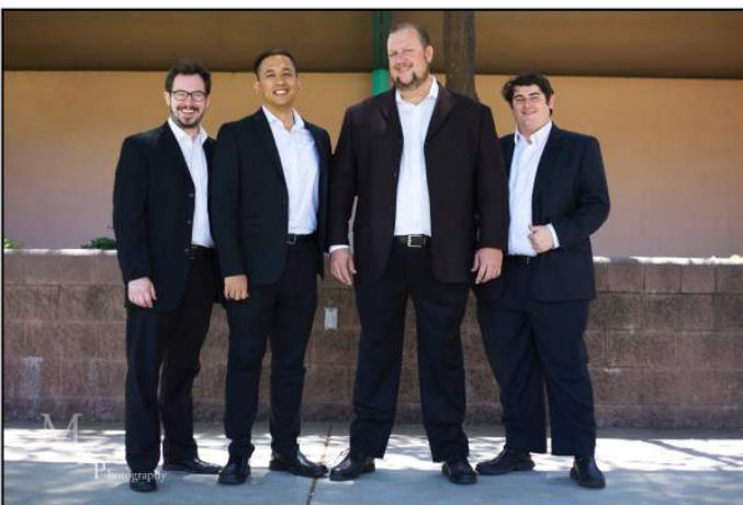
Game On 69.8 Out of District for Score