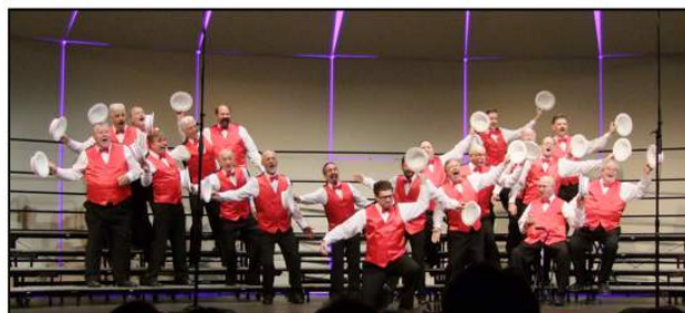
7 Santa Rosa, CA 59.3