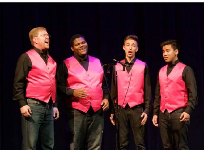
6 Just4Kix 65.7