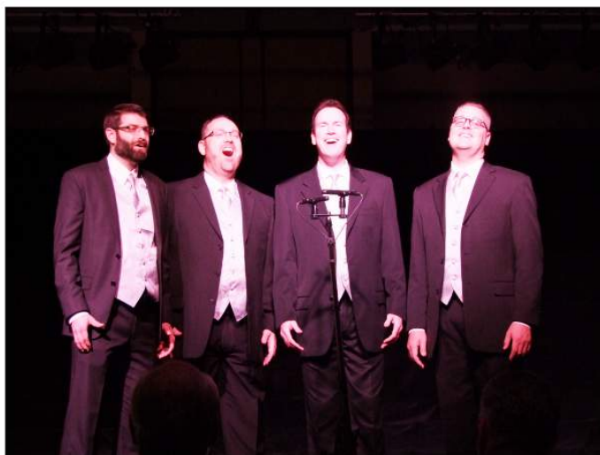
1 North of the Border 75.8