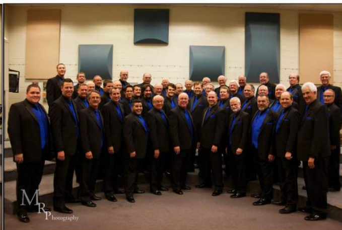
2 Greater Phoenix 77.8