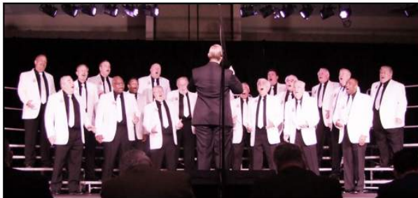
3 Inland Empire, CA 66.3