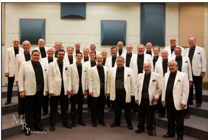
3 Tucson, AZ 66.9