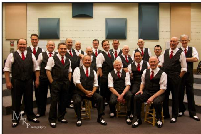
1 Salt River Valley 78.7