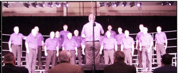
4 St George, UT 65.3