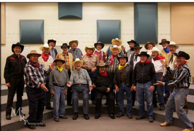
4 Sun Cities 59.5