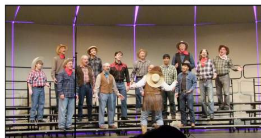
6 Santa Cruz, CA 59.4