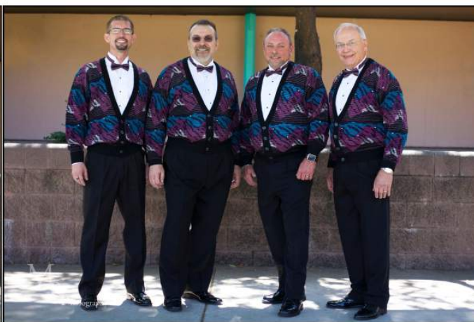
8 The Night Howls 62.5