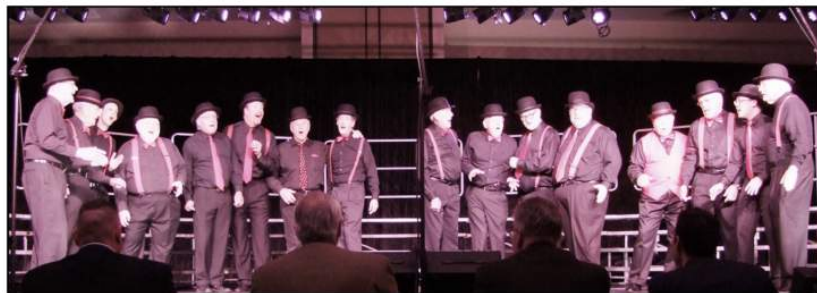
5 South Bay, CA 56.5