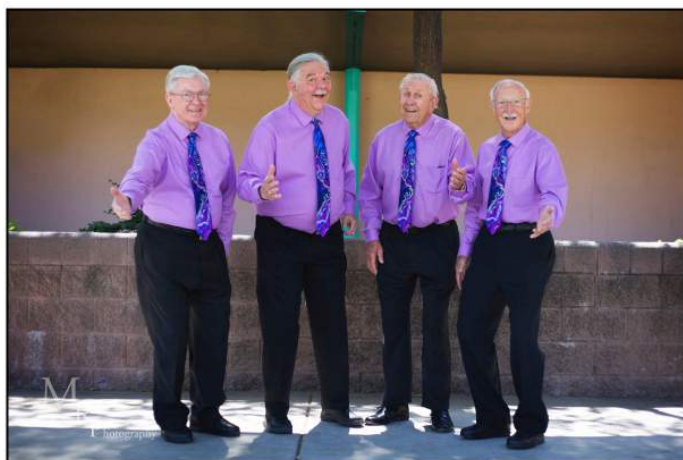
9 Antique Parts 62.1 Senior & Super Senior Champs