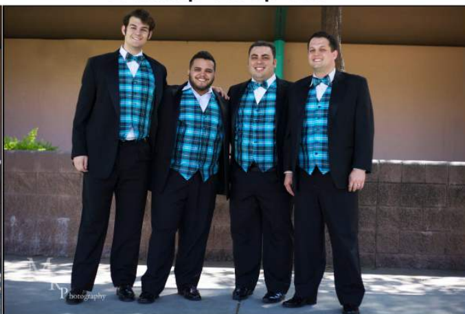
4 Batteries Not Included 71.7