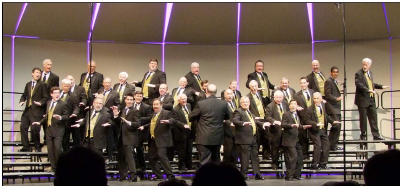
2 Bay Area, CA 80.8