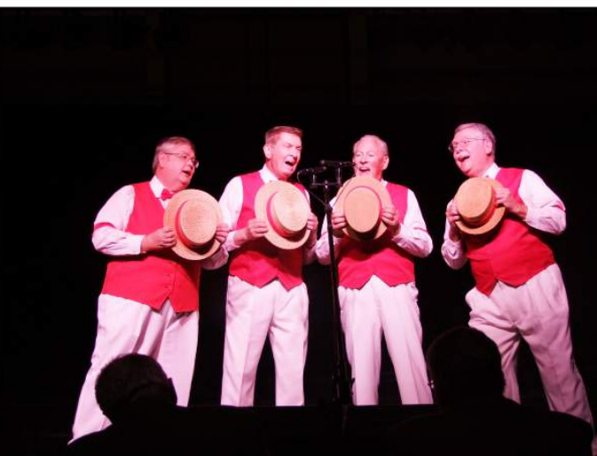
2 Velvet Frogs 68.7