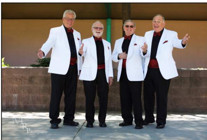
10 Mountain Sound 58.1 Senior