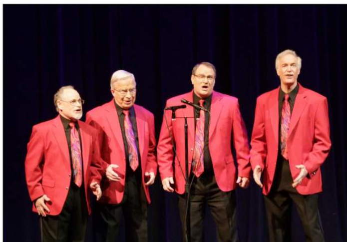
5 Spellbound 66.2