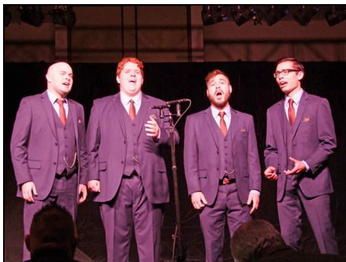
The Newfangled Four 82.7