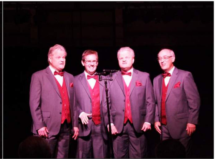
2 Four Fifteen 67.2