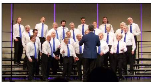
4 Marin, CA 62.8