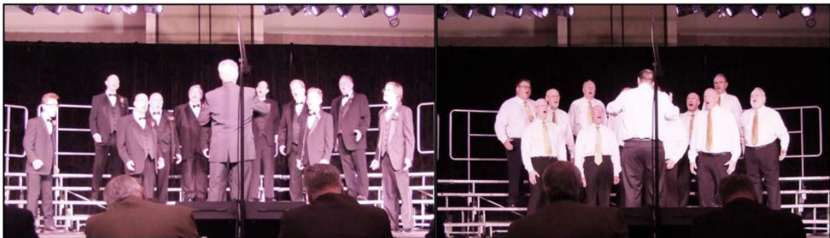
3 Pasadena, CA 59.0