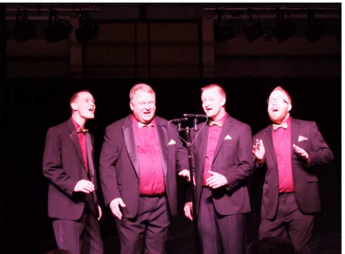
4 Friday Matinee 64.6