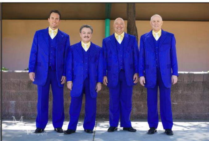
2 Whoop "Em Up 76.3