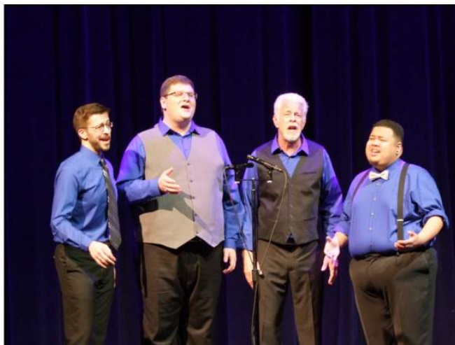
3 Some Friends Of Mine 73.7