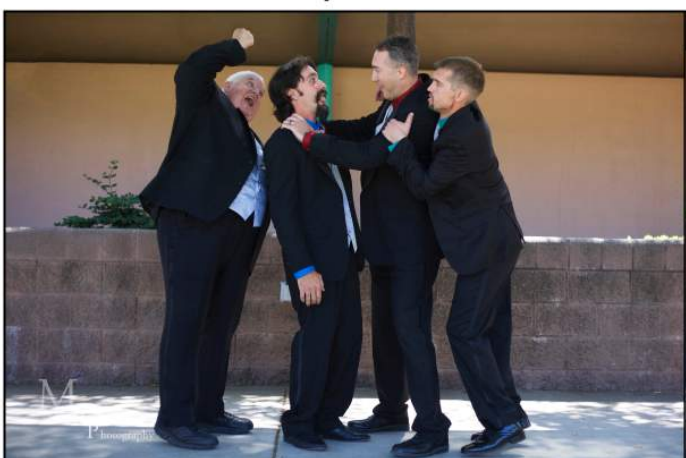
5 Intonation 68.8