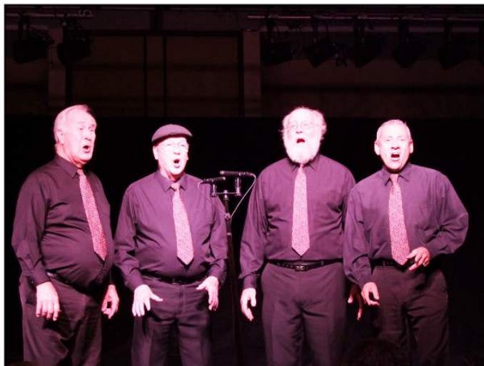
5 Fremont Street Experience 62.6 Senior