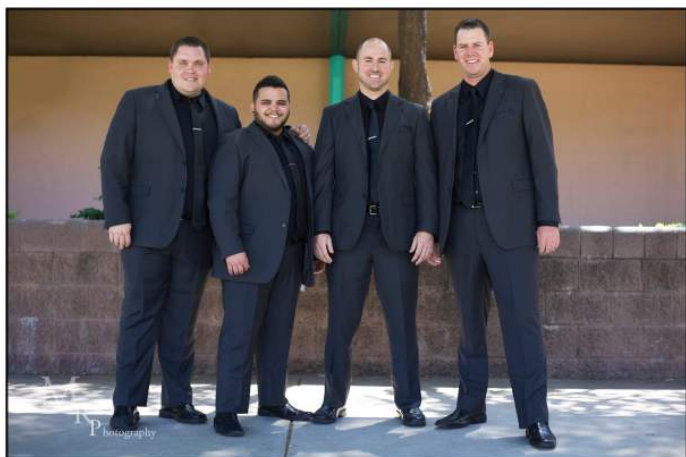
1 Suit Up 77.2