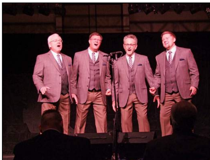
American Pastime 78.6