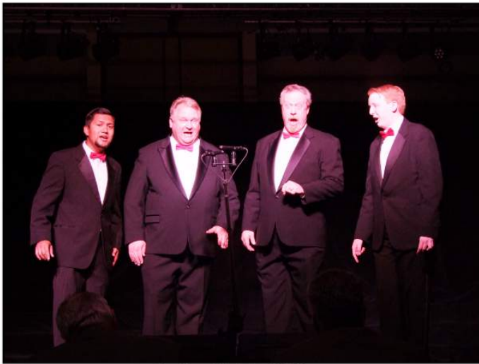
1 Go Fish! 68.0