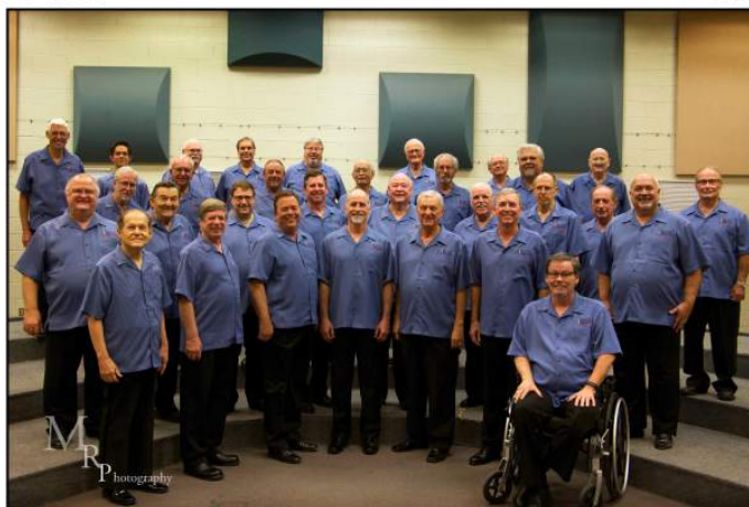
Mesa [Evaluation Only]