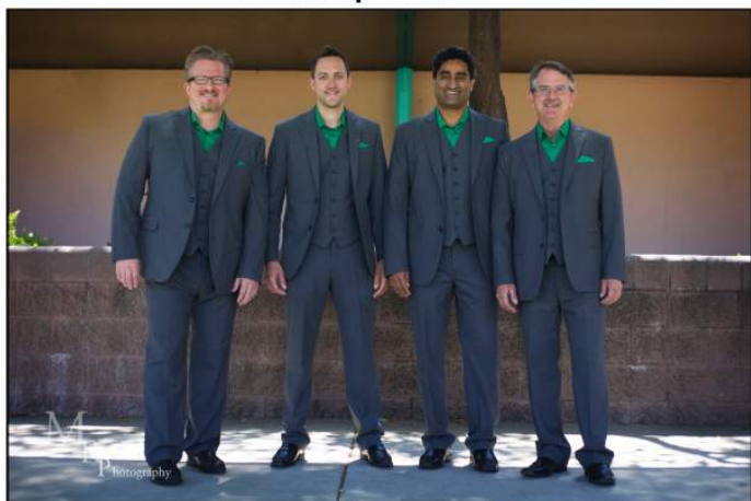
3 Hot Spot 72.8