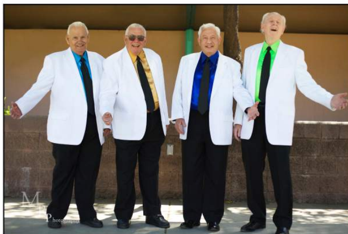
11 entrenous 50.7 Senior & Super Senior