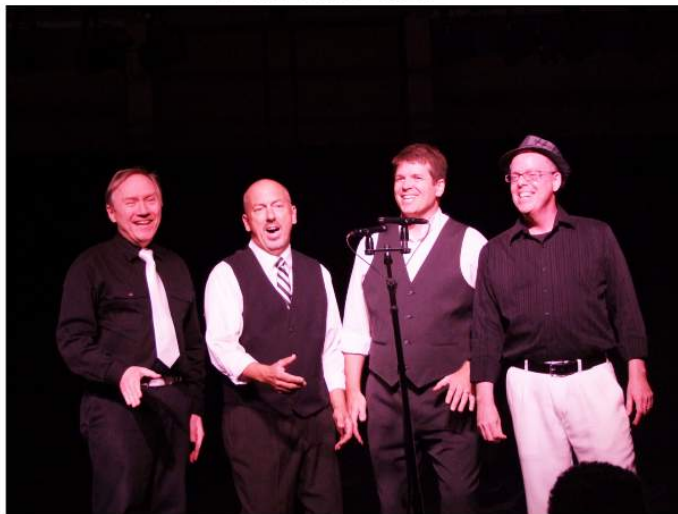
3 Behind the Barn 67.0