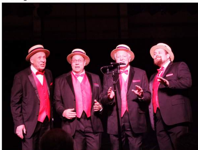
5 Gen Gap 61.3