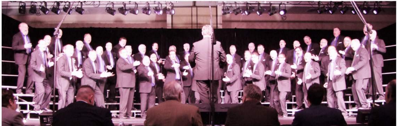
2 Las Vegas, NV 73.3