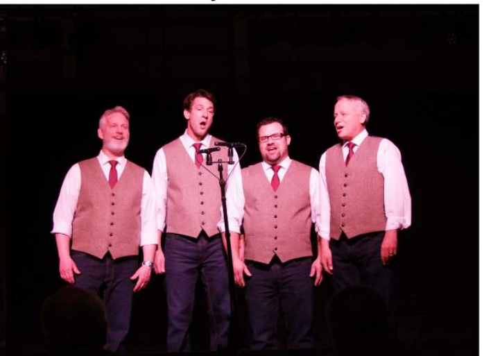
6 Pacific Ring 62.3