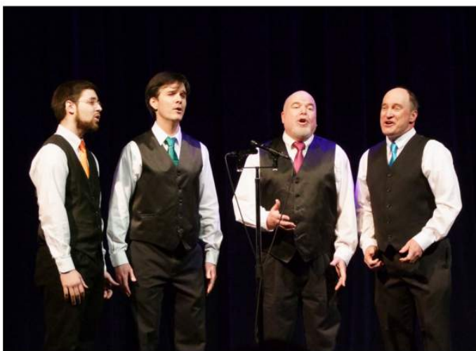
7 Seaside 65.0