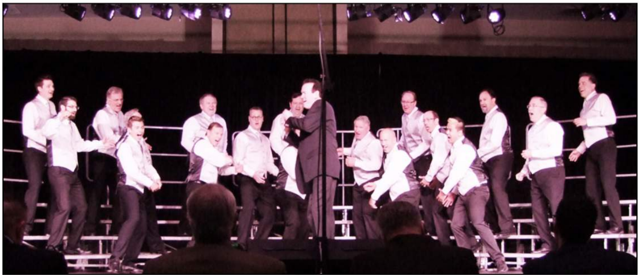
1 La Jolla, CA 77.3