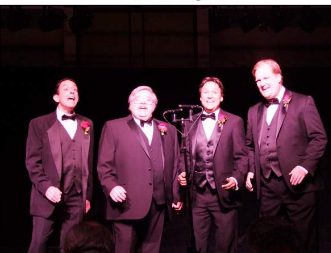
4 Ten O'Clock Shadow 63.9