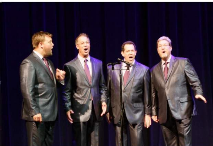
2 Dynamix 74.7