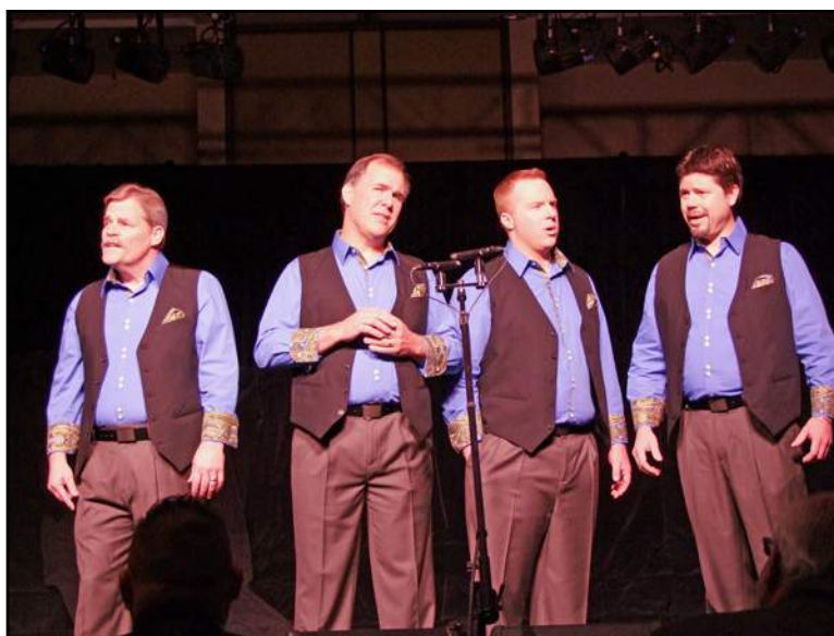
Artistic License 85.6