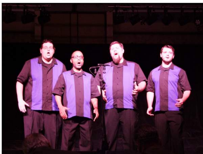
3 West Coast Ringers 65.1