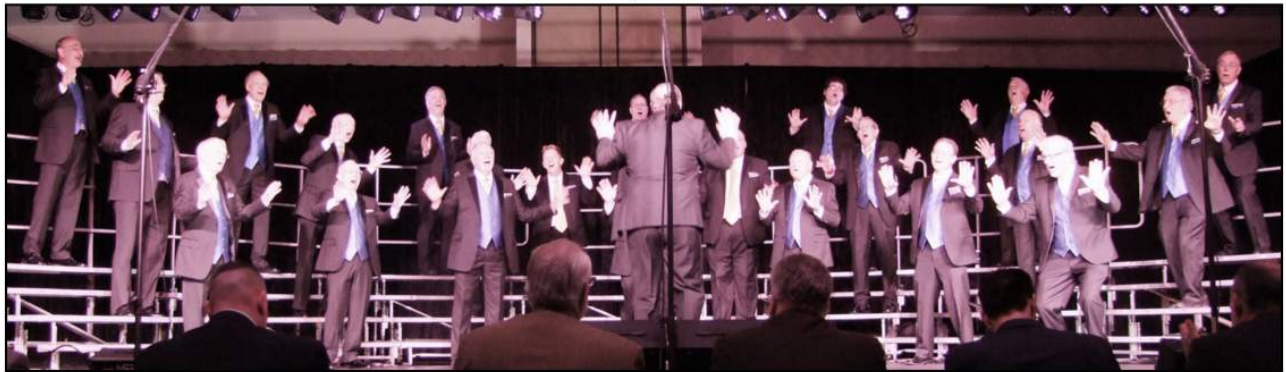
2 Santa Monica, CA 65.5