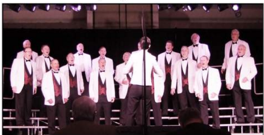
5 San Diego, CA 63.9