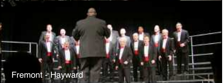
Fremont - Hayward