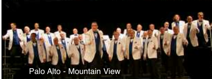
Palo Alto - Mountain View