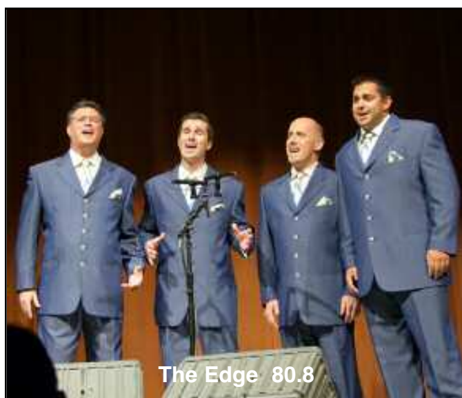
The Edge 80.8

The FAR WESTERN DISTRICT includes Arizona, California, Hawaii, Nevada and Southern Utah