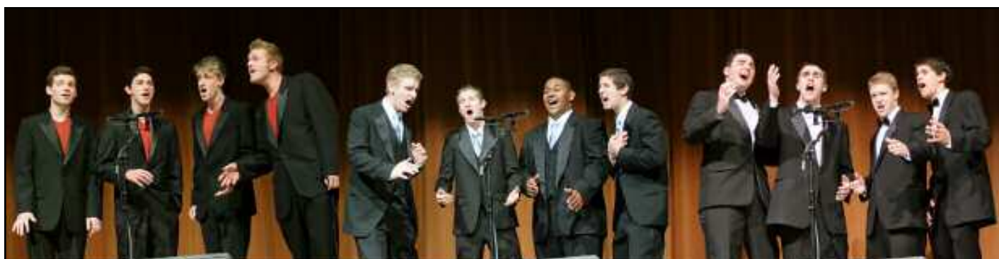
1 The Rolling Tones