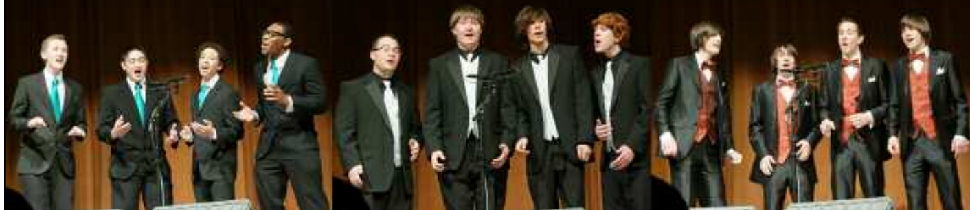
4 Sharply Flat