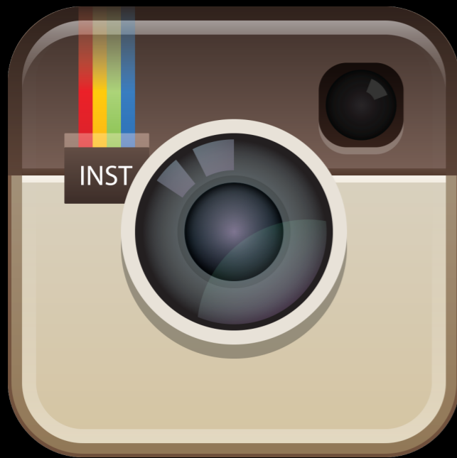
Photo-based Social Media