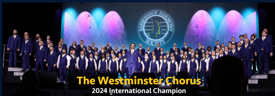
The Westminster Chorus 2024 International Champion