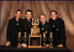
OC Times (20-Year Anniversary)