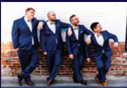
The Newfangled Four