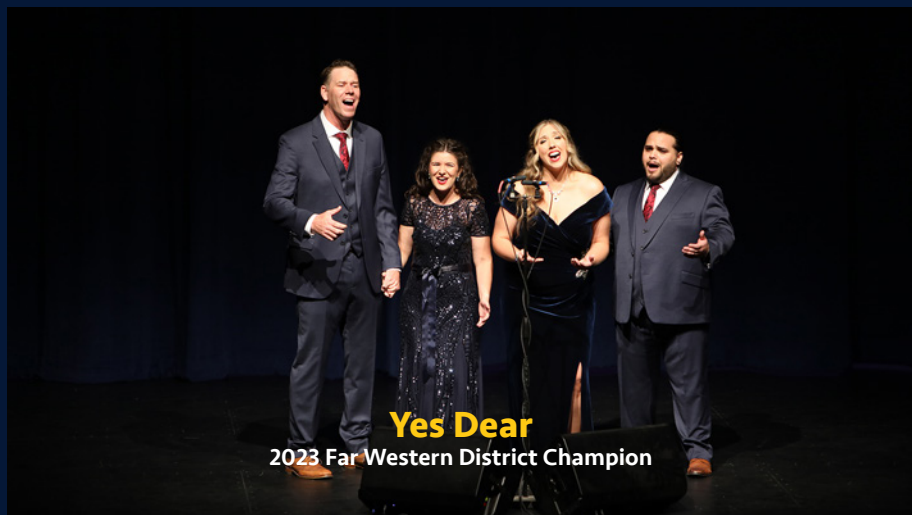
Yes Dear 2023 Far Western District Champion