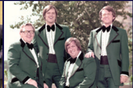
The Command Performance (50-Year Recognition)