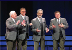
American Pastime (10-Year Anniversary)