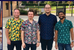
The Summertimers Harmony Band