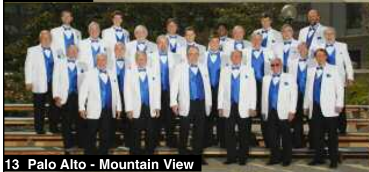
13 Palo Alto - Mountain View