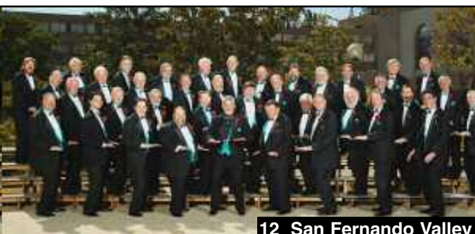
12 San Fernando Valley