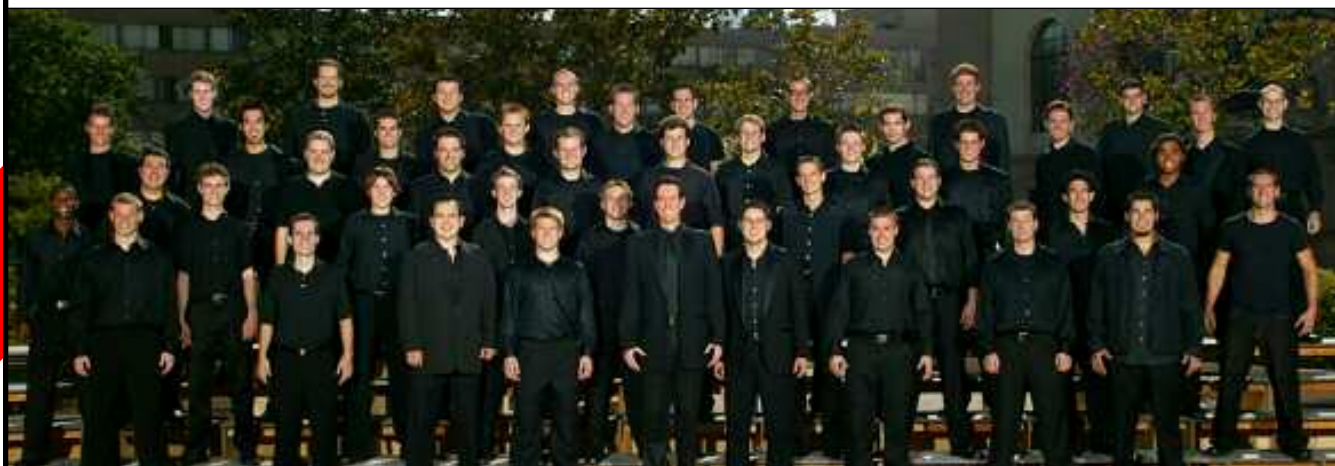
2005 FWD Chorus Champion Westminster

The FAR WESTERN DISTRICT includes Arizona, California, Hawaii, Nevada and Southern Utah