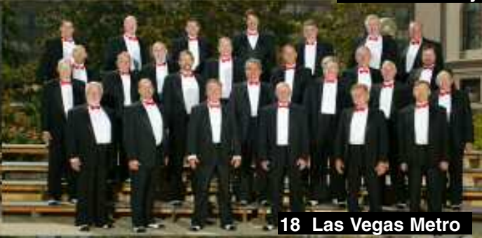
18 Las Vegas Metro