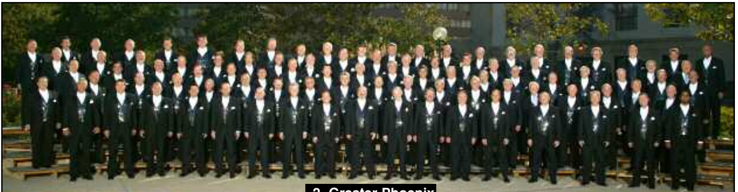
2 Greater Phoenix