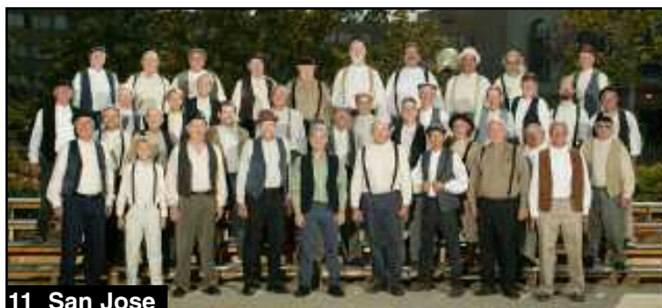
11 San Jose