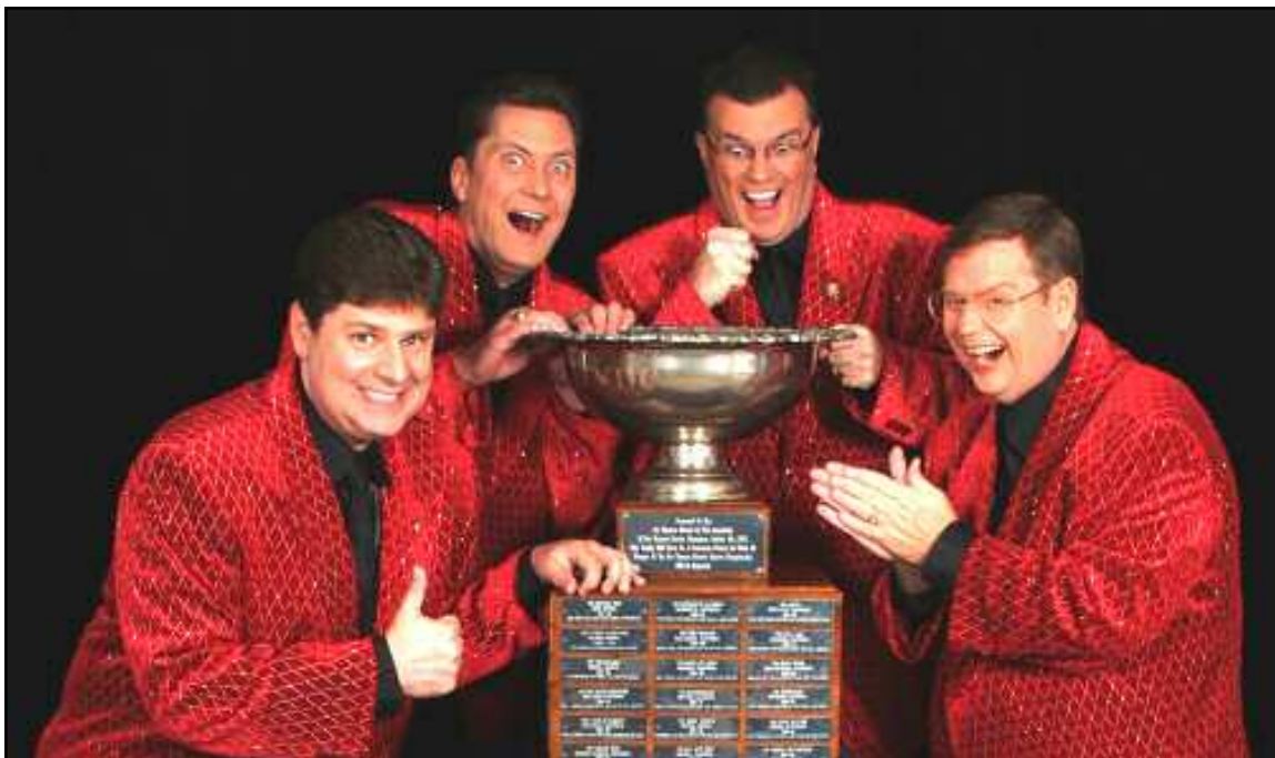
2005 FWD Quartet Champion Hi-Fidelity