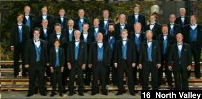
16 North Valley