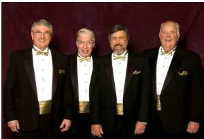
2005 FWD Senior Quartet Champions Vintage Gold