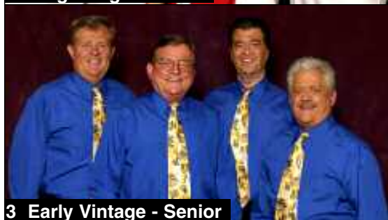
3 Early Vintage - Senior

The quartets above were eligible to compete in the Far Western District Senior Quartet Contest. The order of finish is indicated.