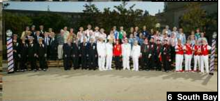
6 South Bay