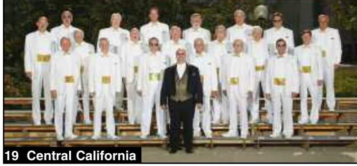
19 Central California