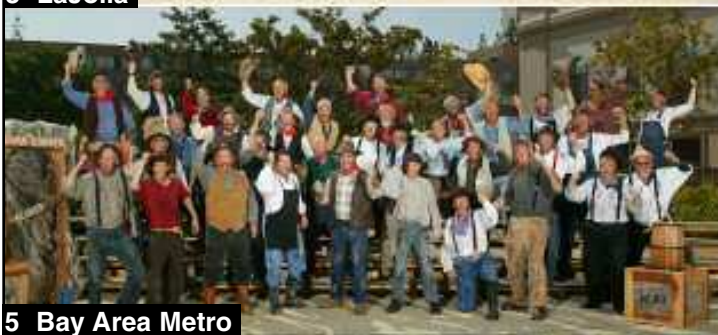
5 Bay Area Metro