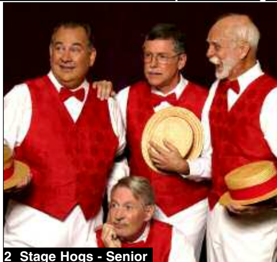
2 Stage Hogs - Senior