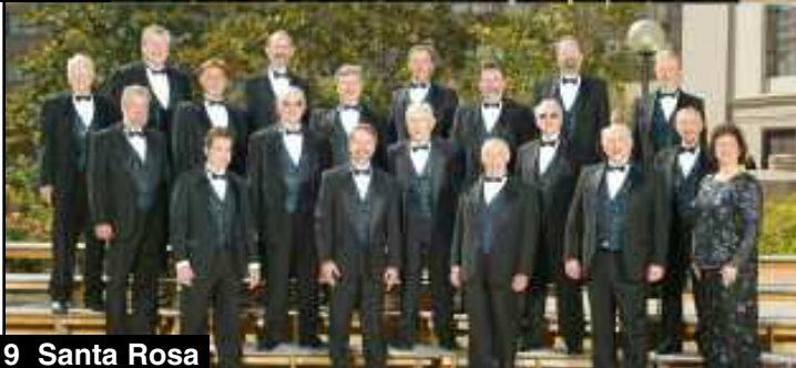
9 Santa Rosa