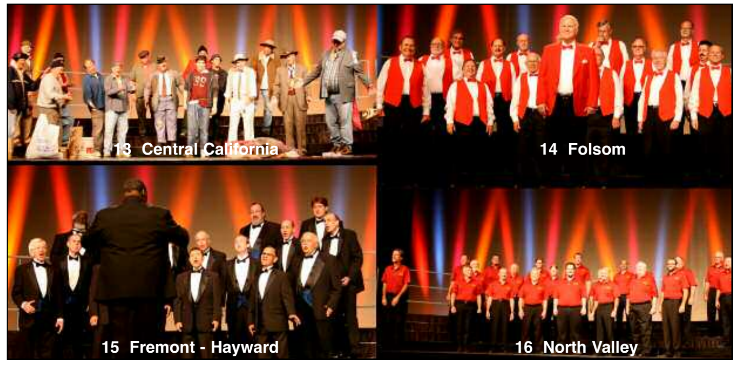
Choruses in order of finish in Sacramento, 2009