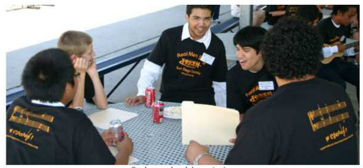
Students at lunch keep singing.

Overall it was a rewarding experience and bodes well for next year. In the meantime, we are forming quartets and ensembles to be coached in preparation for our next event, a Young Men's Vocal Ensemble Showcase, April 24, 2010. This concert will include male groups of any vocal genre for a diverse program, and it will expose a larger audience to barbershop harmony.