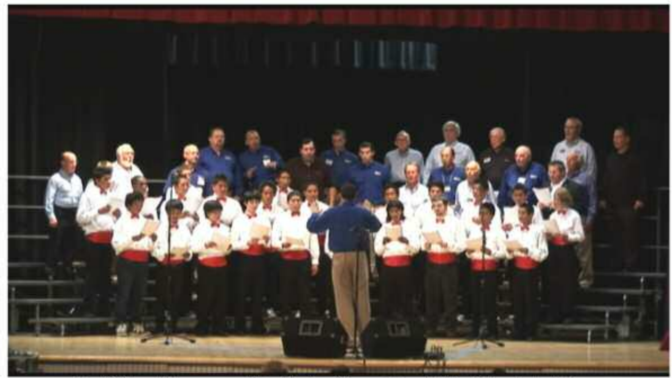
Pacific Coast Harmony and Sun Harbor Chorus "stand behind" the student chorus.

We had the support of all four San Diego County men's barbershop chapters: Pacific Coast Harmony of La Jolla, Sun Harbor Chorus of San Diego, Music Masters of El Cajon and Music Men of Palomar-Pacific. These men sang Coney Island Baby/We All Fall Medley with the student chorus.