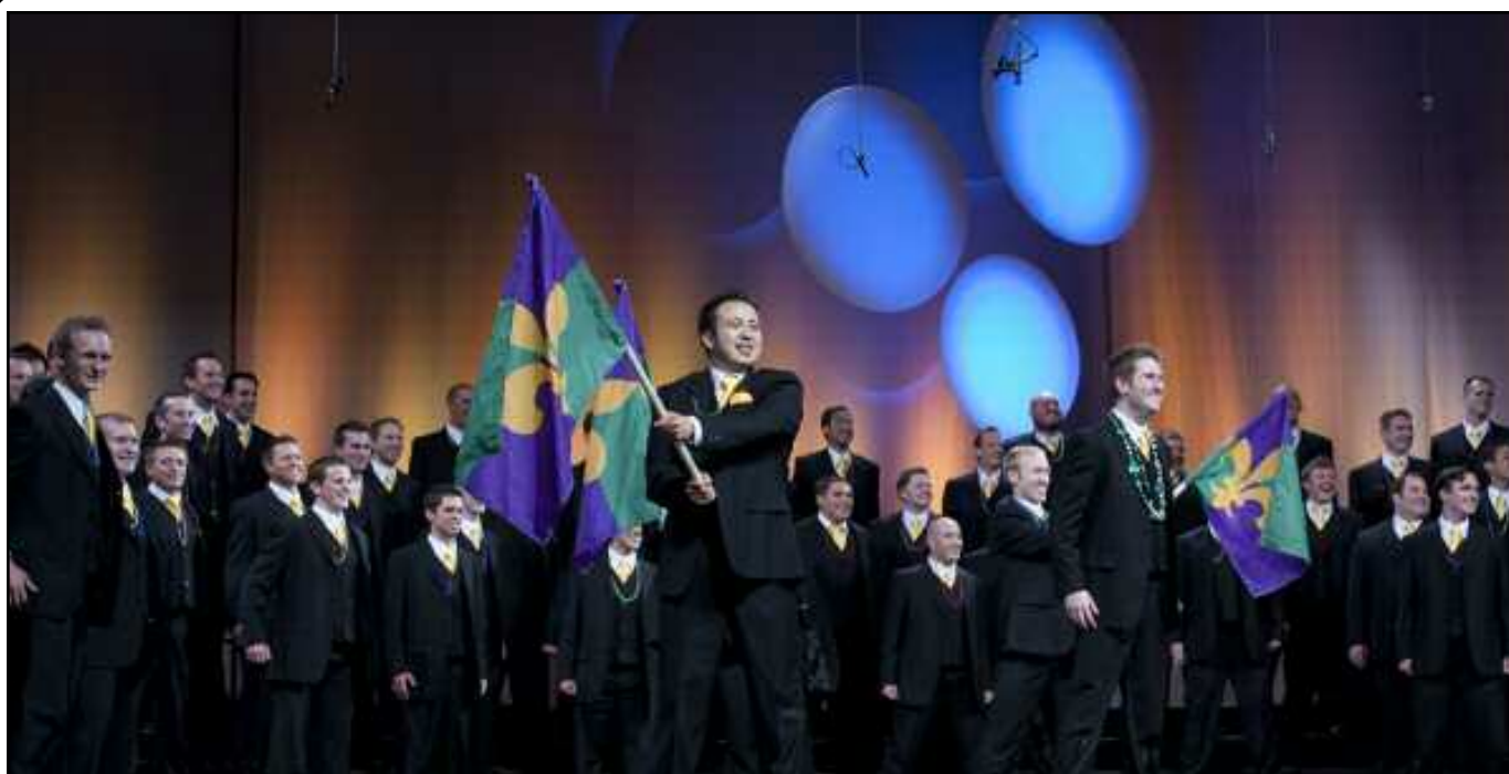
2010 International Chorus Champions - Westminster

WESTUNES, established in 1951, is the official publication of the Far Western District Association of Chapters in the Barbershop Harmony Society, Inc.