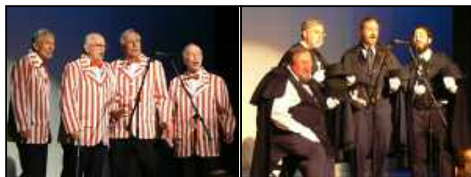
5 A Song and a Smile 7 Reformed Villains