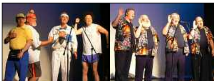
2 Triglycerides + 1