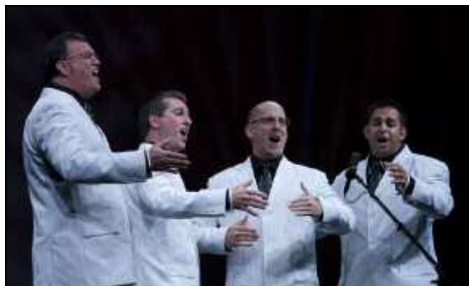
14th The Edge

The FAR WESTERN DISTRICT includes Arizona, California, Hawaii, Nevada and Southern Utah