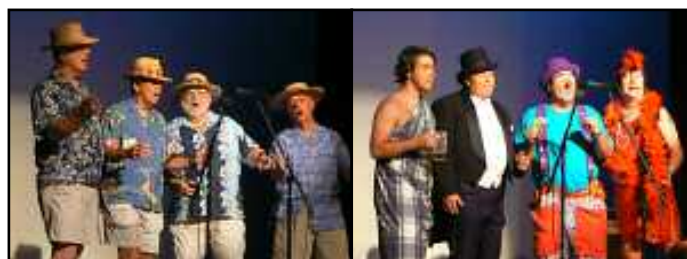
4 C Nile Sound