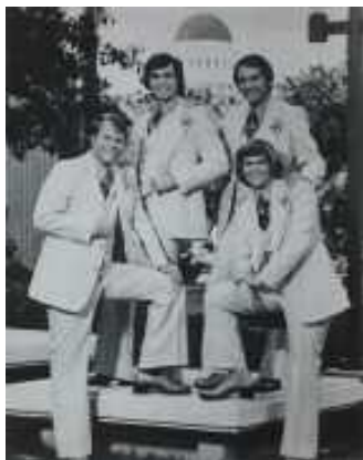
THE 139 th STREET QUARTET