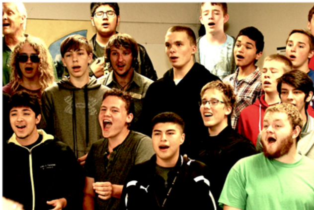
A sampling of Great expressions