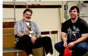
Father / Son - Done setting up risers!!