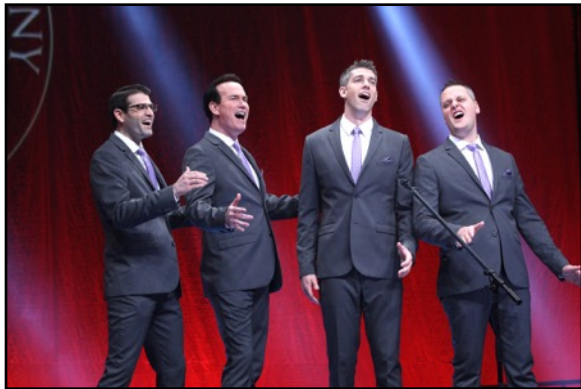
North of the Border 34th 78.6%