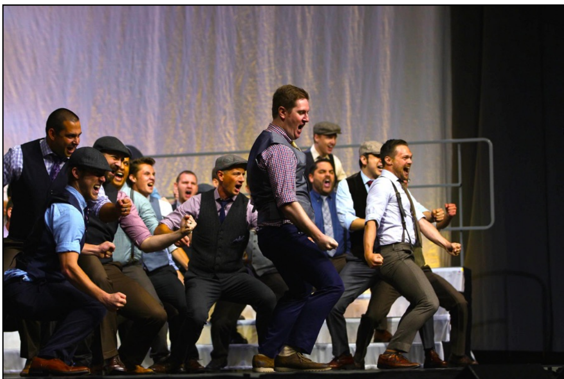
WESTMINSTER Wins The GOLD with a score of 97.5%