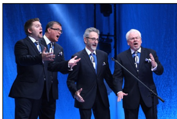
American Pastime 28th 79.1%