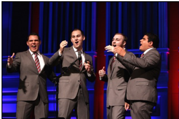
Flightline 5th 78.7%