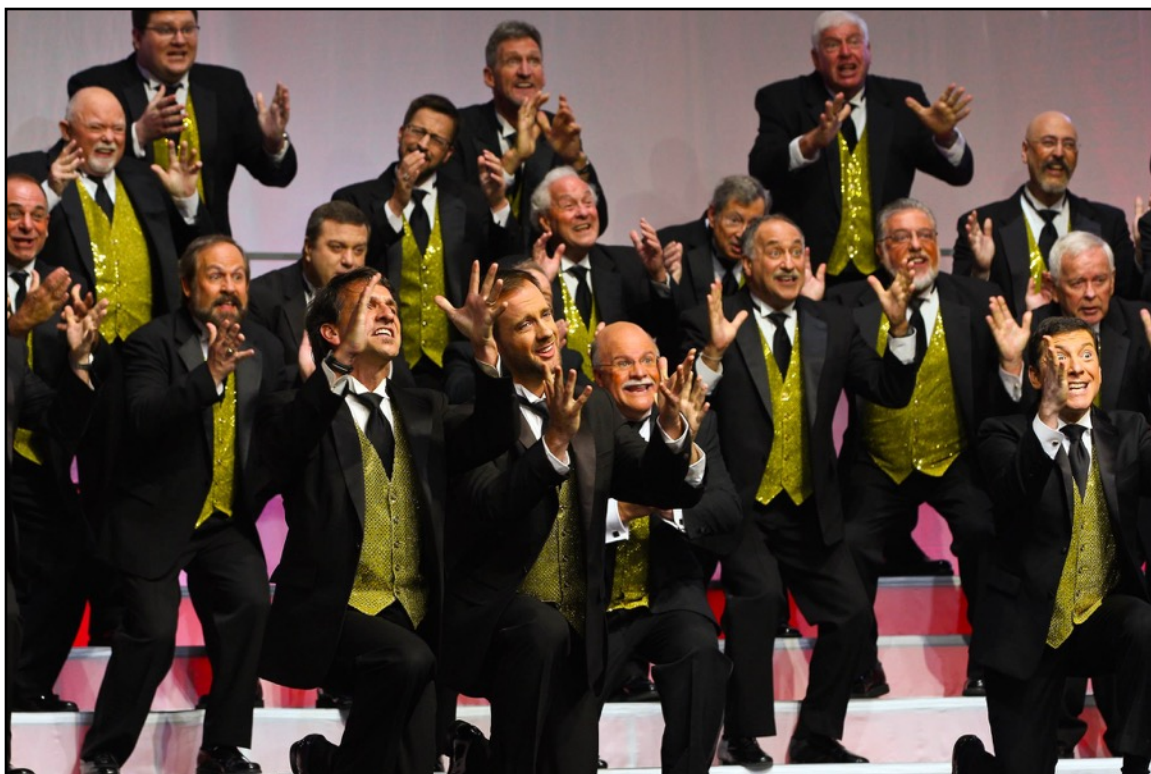
Bay Area 18th 81.2%