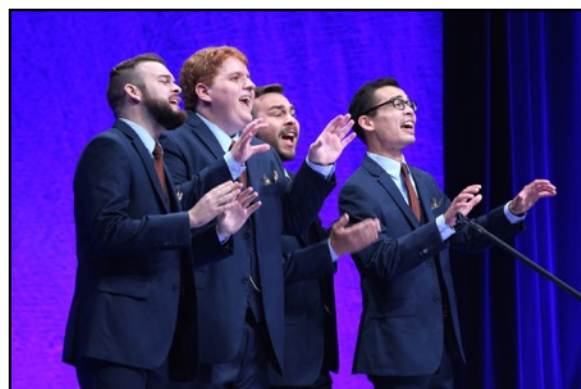
The Newfangled Four 14th 83.2%