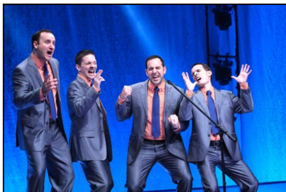
The Crush 7th Place 88.0%