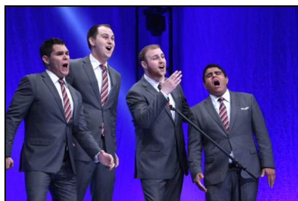
Flightline 30th 78.9%