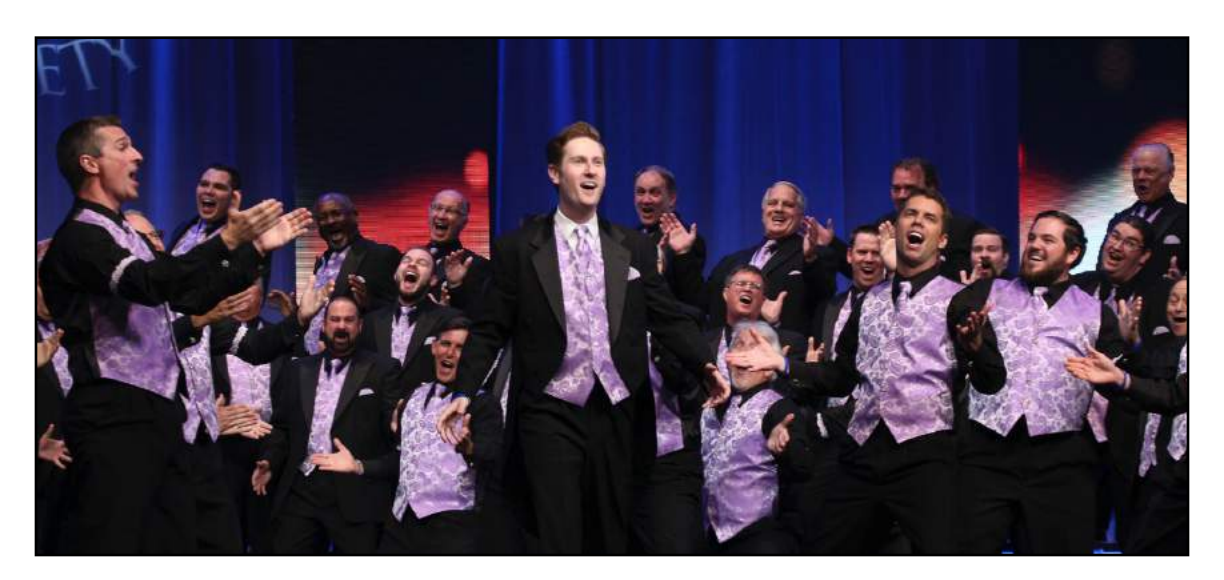
3rd Masters Of Harmony 94.0