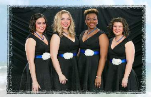
C'est La Vie 2016 Region 21 Champions 2015 International Rising Star Champions