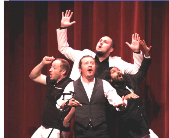
Summertimers Harmony Band is our 2025 Headliner Quartet from the Far Western District

HARMONY CAMP IS FUN: ringing chords, friends, ice cream, tag singing, music coaches, a cappella / barbershop, international quartet champions, ping pong, woodshedding, vocal production, singing, quartet coaching.